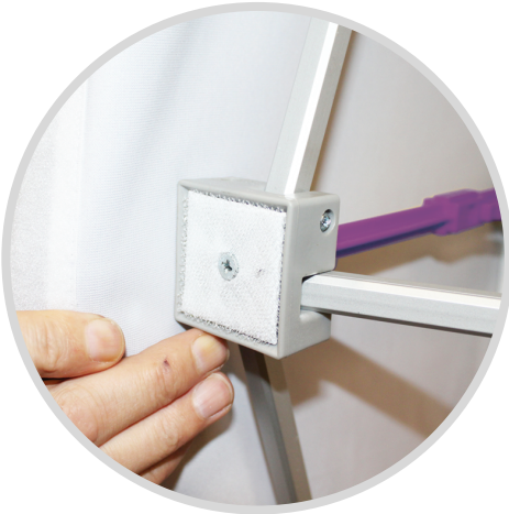
Wrap the graphic ends around the frame, connecting the velcro strip and tabs together.