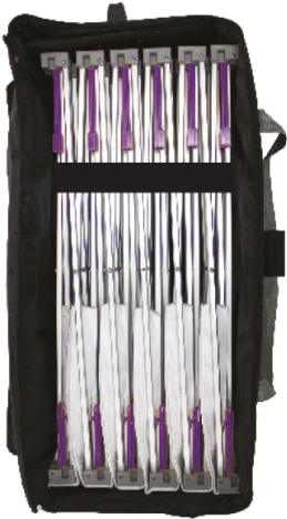
Remove frame and graphic from wheeled carry bag.