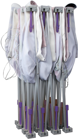
Printed graphic is already attached to the collapsed frame.