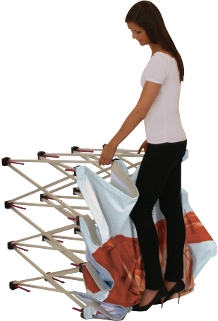
Open the frame outwards.