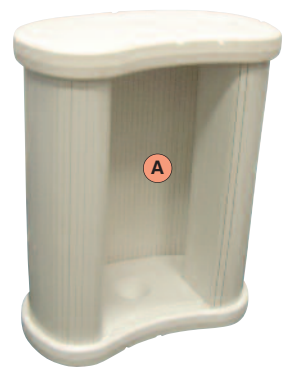
Kneehole style counter