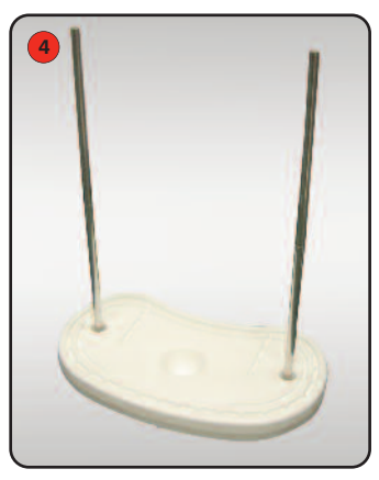
Repeat step 3 for the other pole and then place the base on the floor.