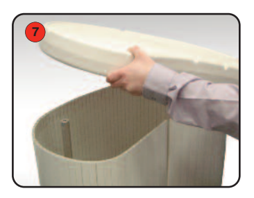
Take the top and align the holes over the poles.