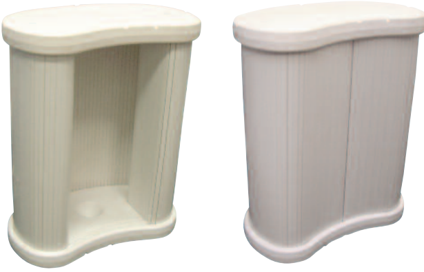
Either Open knee hole or full wrap configurations can be acheived with the same components.