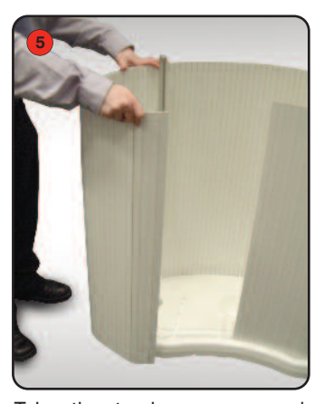
Take the tambour wrap and insert the bottom edge into the grooved guide on the base. Ensure the tambour is fitting securely into the groove.