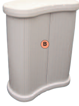
Full wrap style counter