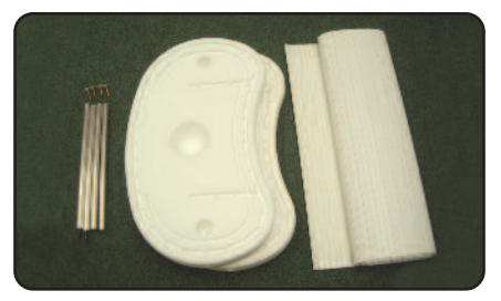
Kit includes: 4 x poles, 4 x screws, 1 x top, 1 x base, 1 x PVC tambour wrap.